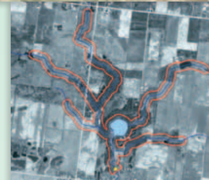
In this example, the yellow dot represents the location of the water intake. The red lines show the area of the Intake Protection Zone.